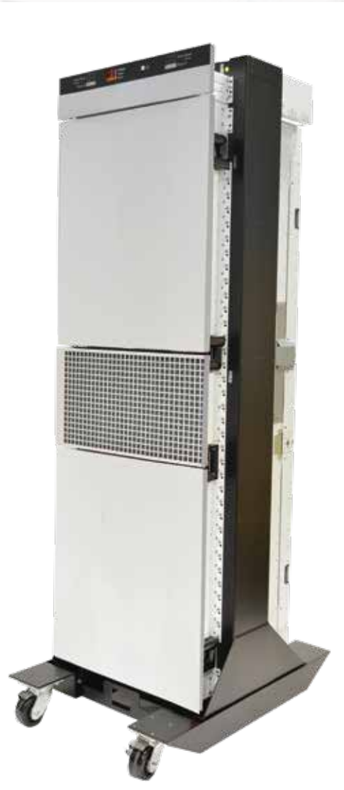
Telecoms and Data Center