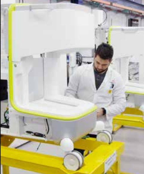
Robotic Surgical Systems