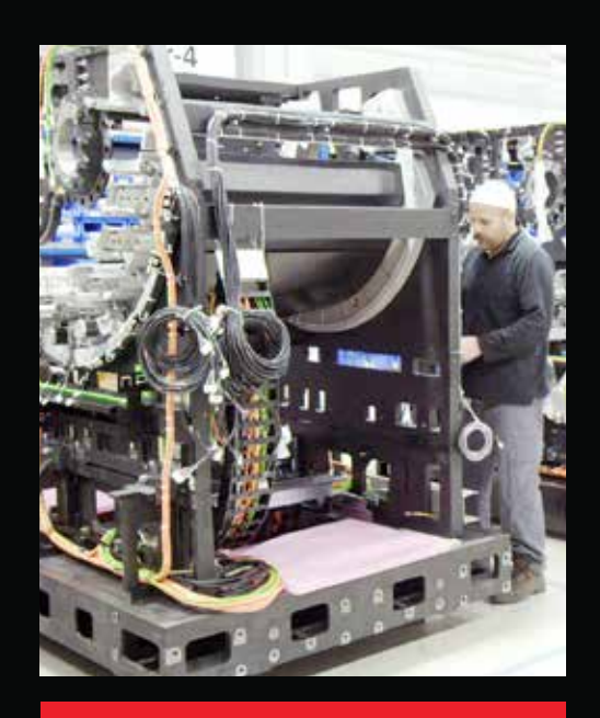
Complex Industrial Systems

Sanmina provides precision machining, enclosure fabrication, complex welding, and electronics manufacturing services. We assemble and test complex electromechanical systems for leading capital equipment suppliers.