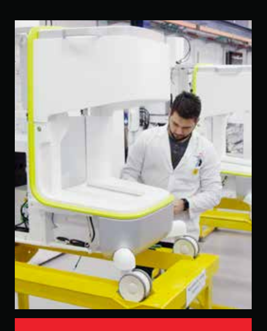
Robotic Surgical Systems