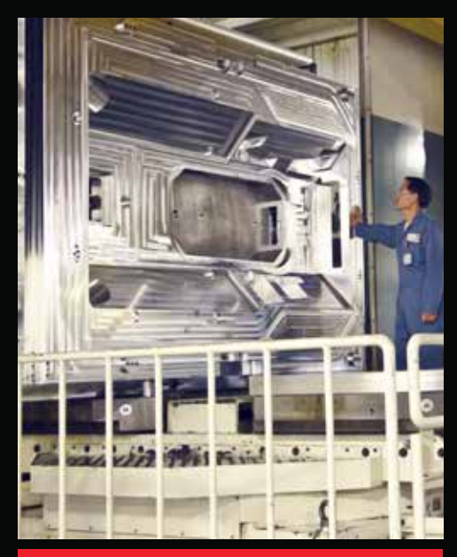
Semiconductor Vacuum Systems