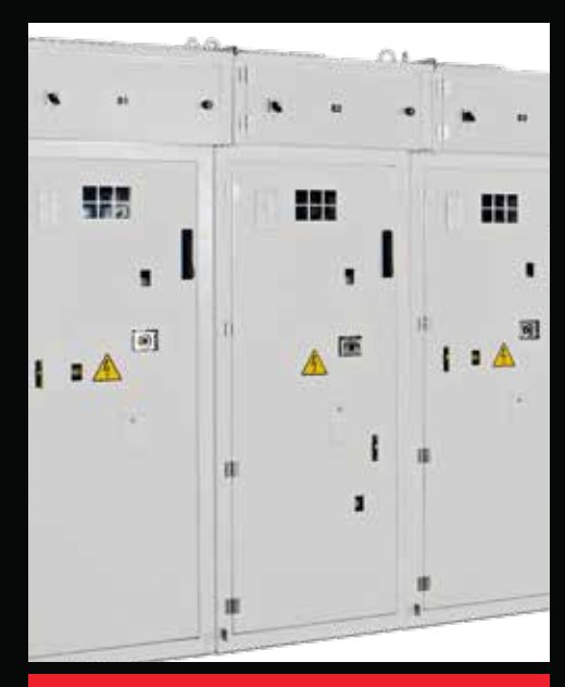
Power Systems and Inverters