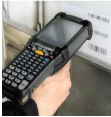
Direct Order Fulfillment and Repair for tens of thousands of scanners