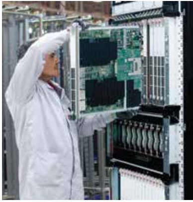
BTO/CTO for complex telecom and cloud storage equipment with thousands of options