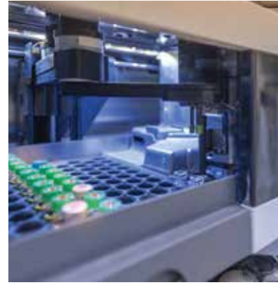
Repair of a broad range of complex medical products at several Sanmina locations

EXPERTISE AND EXPERIENCE WITH COMPLETE PRODUCTS & TECHNOLOGY ACROSS A WIDE RANGE OF INDUSTRIES. Sanmina has developed a post manufacturing & aftermarket service strategy based on a robust IT technology, supply chain optimization, lean practices, strong materials management practices, established quality systems, advanced engineering services that deliver value and an integrated global service solution.