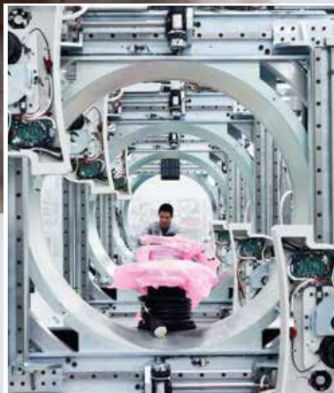
LIFE CYCLE MANAGEMENT