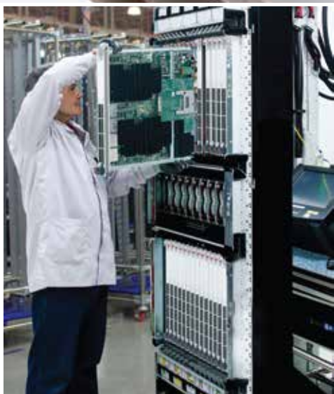
FULFILLMENT & INTEGRATION