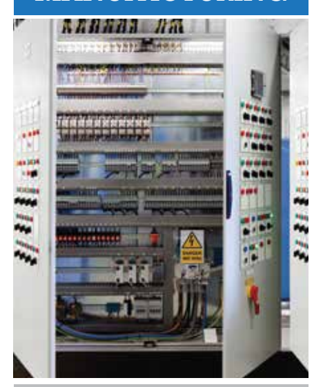
Manufacturing and sub-assembly integration

We design and produce turnkey cable assemblies, complex wiring harnesses and integrated electro-mechanical panel assemblies or subsystems for a variety of medical, automotive, industrial, defense & aerospace, semiconductor equipment, power systems and telecommunication applications.