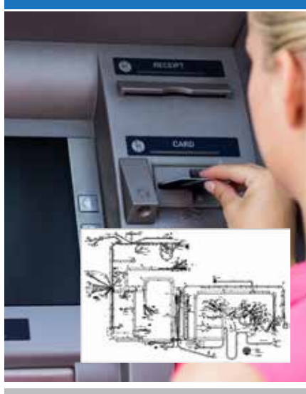
Designs for complex cable interconnect systems like ATMs