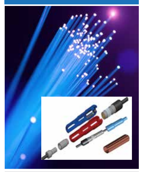
Our fiber optic expertise includes material selection and process technology