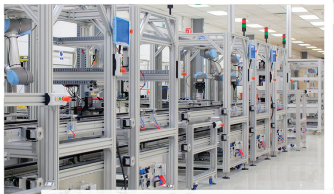
Sanmina Automation Line for Set Top Box Production