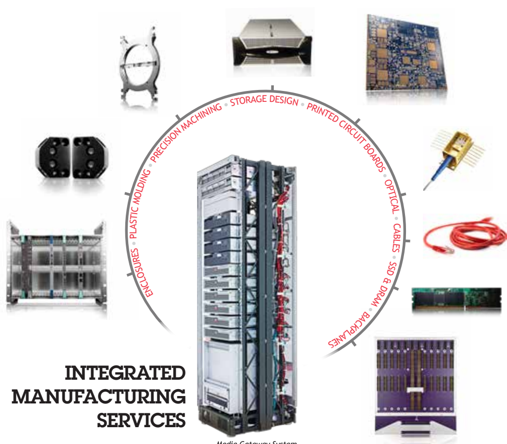
Media Gateway System Built Turnkey by Sanmina

Sanmina maintains a network of regional design, quick turn, New Product Introduction (NPI) facilities and repair centers, in addition to a complete global footprint of manufacturing operations in 23 countries on six continents. Each day, in every region of the world, Sanmina designs, manufactures, ships and repairs complex, mission-critical products. For over 30 years, customers have come to expect quality, delivery, reliability and service from Sanmina. Together we build productive relationships based on exceptional customer satisfaction.