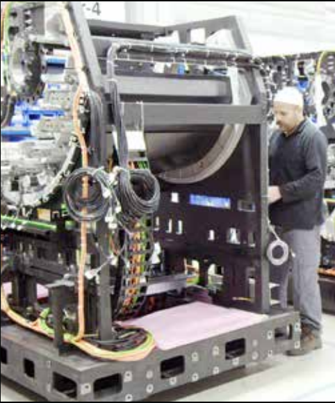
Complex Industrial Systems

Sanmina provides precision machining, enclosure fabrication, complex welding, and electronics manufacturing services. We assemble and test complex electromechanical systems for leading capital equipment suppliers.