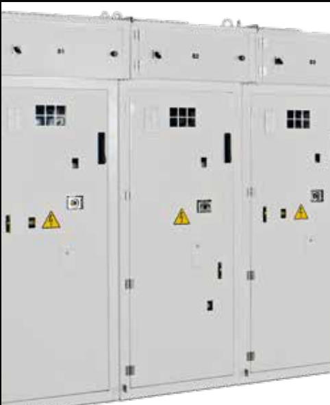
Power Systems and Inverters