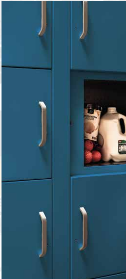
Smart Locker Systems