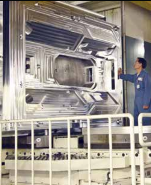
Semiconductor Vacuum Systems