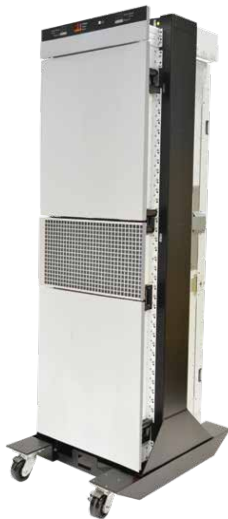
Telecoms and Data Center