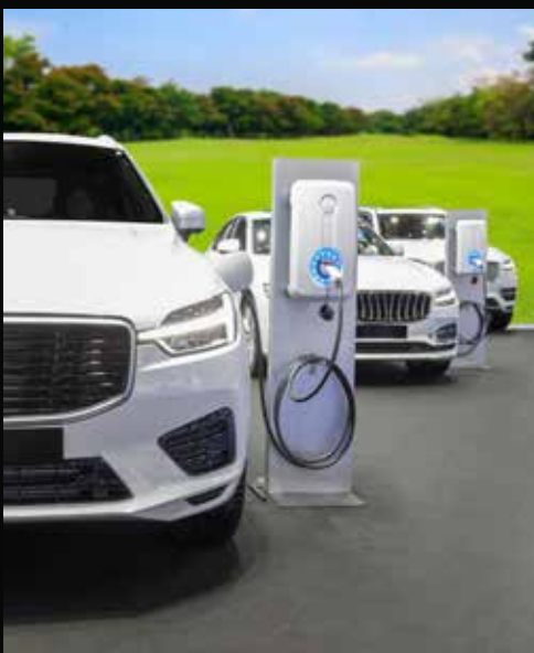
Electric Vehicles and Charging Stations