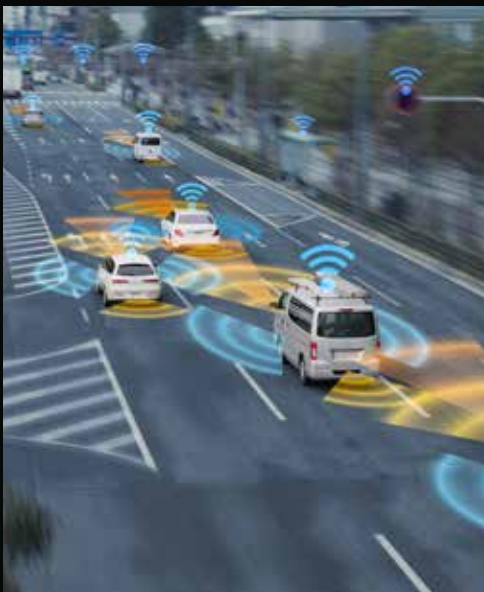
LIDAR and RADAR System Design

Sanmina's expertise in automotive systems, advanced communications and microelectronics is driving tomorrow's automotive solutions in partnership with the world's leading automotive OEMs and their electronic system suppliers.