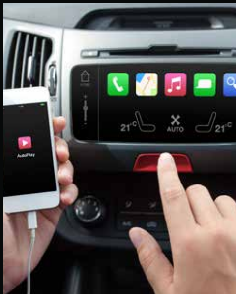
GPS, Infotainment and Climate Control