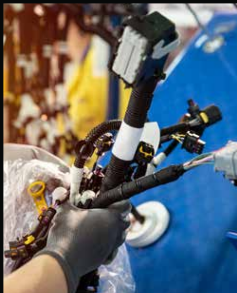
Cables and Harnesses